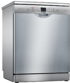
Bosch 60cm Series 4 Anti-Fingerprint Freestanding Dishwasher