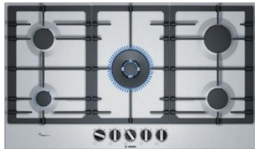
Bosch 900mm Series 6 5 Burner Gas Cooktop