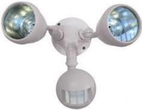
House watch twin halogen Sensor