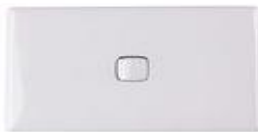
Single Switch with Wall Plate