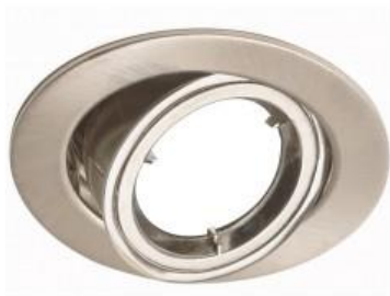
LED Down Lights