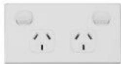
Double Power Point