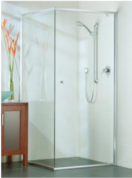
Semi frameless shower screen