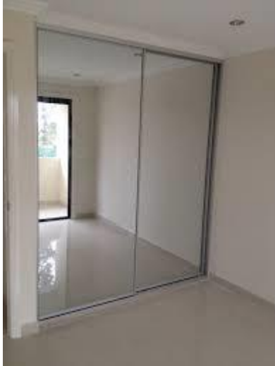
Sliding mirrored door