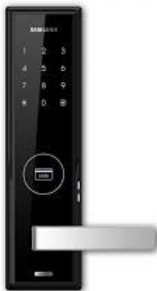
Front door Lever Digital keyless Lock