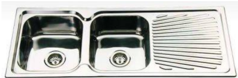
Kitchen sink Square Edge Double Bowl Sink