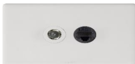
TV and Data socket