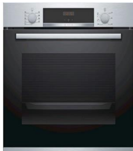
Bosch Series 4 71L Multifunction Built-in Electric Oven. Offering 7 heating functions and an electronic clock with end time programming