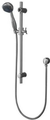
Shower rail Hand Shower Rail 5 Functions, solid brass rail with elbow