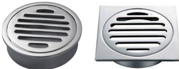
Drain Square Floor Gate 100mm Round Floor Gate 100mm Made of Brass, Chrome Finish