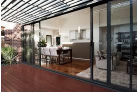
Aluminium Alfresco Sliding Door