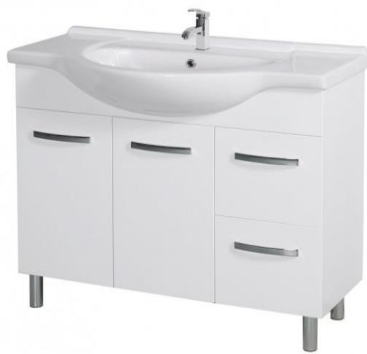
Cartia Lauren 900mm Waterproof Right Hand Drawer Vanity WPCV-L900RHD1TH