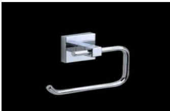
Toilet paper holder Made of Brass, Chrome finish