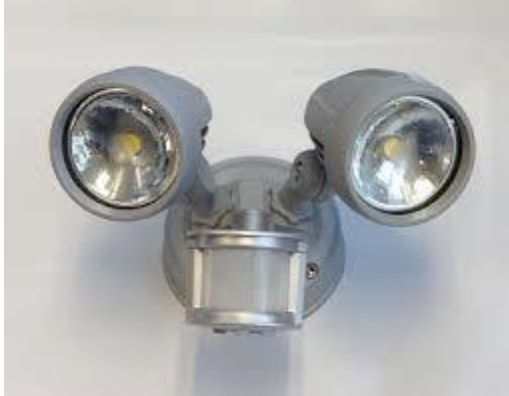
House watch twin halogen Sensor