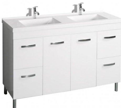
Cartia Amelia 1500mm Waterproof Double Vanity WPCV-A1500DB1TH 9341813002968

The Cartia Amelia 1500mm Double Vanity features two basins, a spacious bench top.