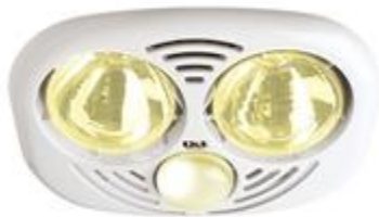
Bathroom Light with Fan options