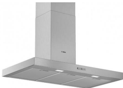
Bosch Series 2 90cm Stainless Steel Wall Mounted Canopy Rangehood