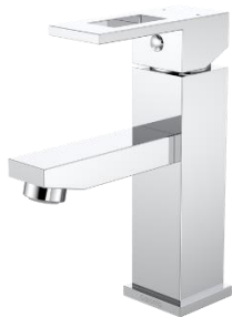
Vanity mixer Fully Square Basin Mixer