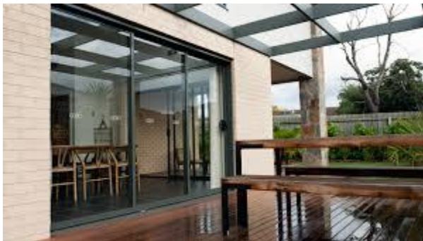
Aluminium Sliding window