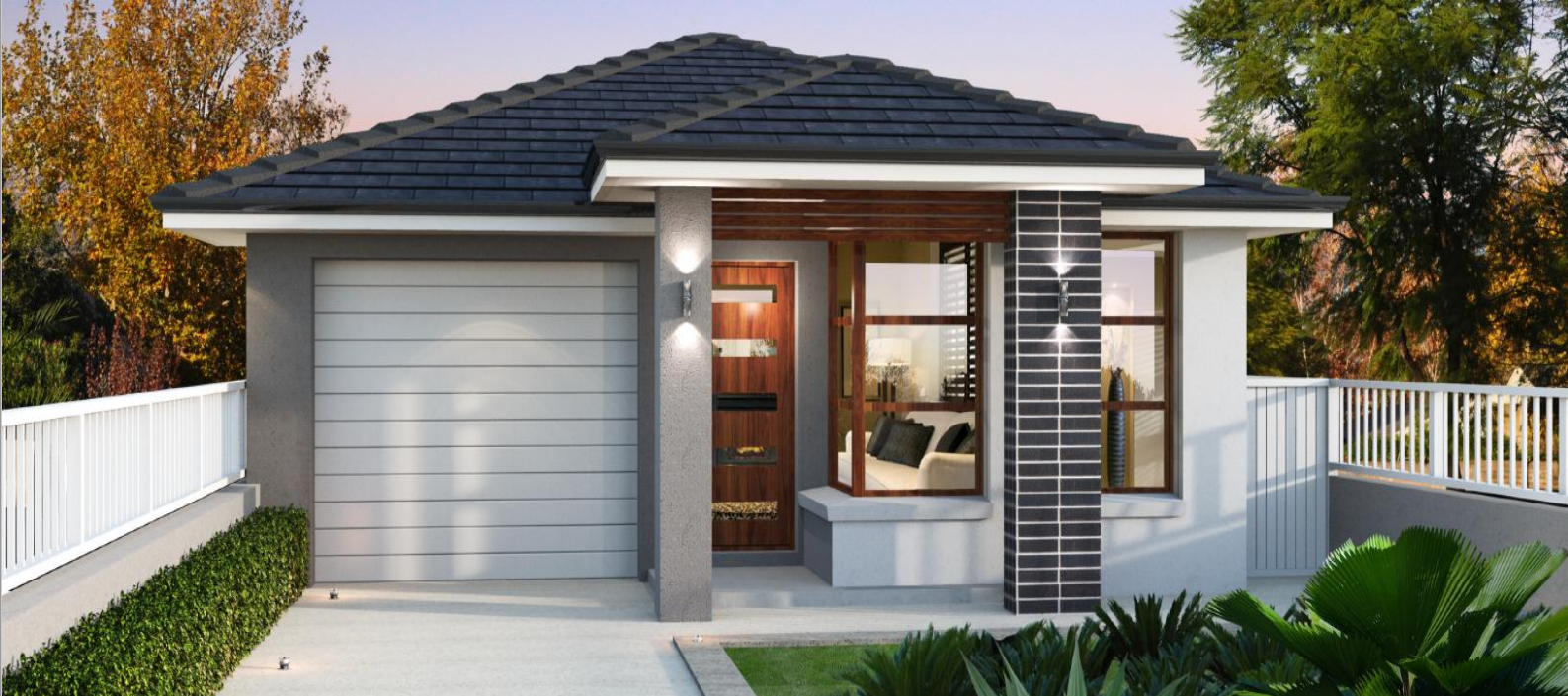
Façade is for illustration purpose only. This façade shows upgraded items not included in standard façade selection.