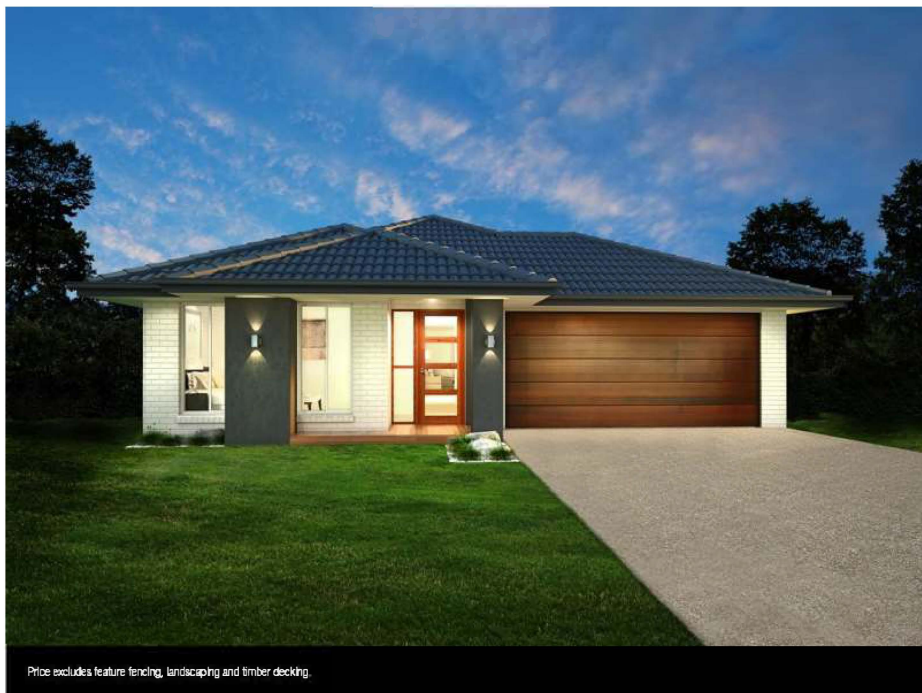
Price excludes feature fencing, landscaping and timber decking.